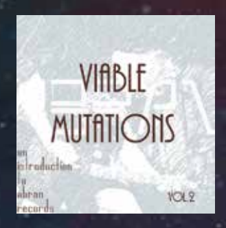
Viable Mutations Vol.2 (compilation) 2017 Abran Records ABR013