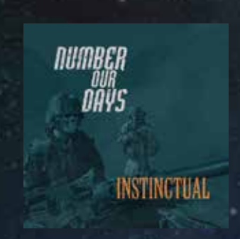
Instinctual 2011 Abran Records ABR003

The future of Number Our Days looks uncertain at the moment but as they say, 'Never say never!'